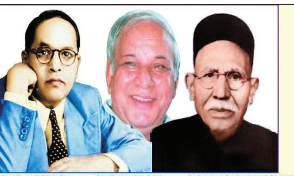
BABASAHEB UR. AMBEUKAR 14 April, 1891 - 6 December, 1956 15 March, 1934 - 9 October, 2006

the Gadhar Movement. It was at this mammoth Ad Dharm conference where he publicly announced the launch of